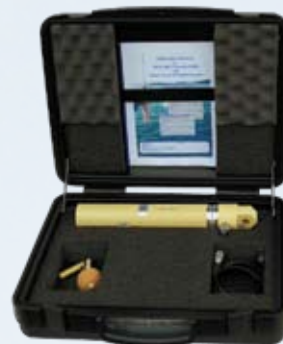
TD304 in it's case

TD304A: absolute type (Tide). TD304R: reference (gauge) type (Water level).